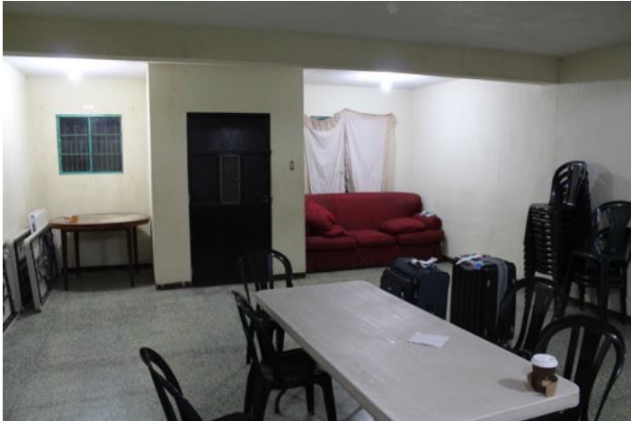
Common room/ Dining area