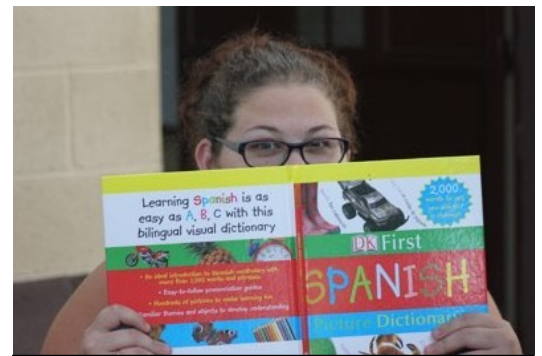
Spanish is not necessary, but very helpful!