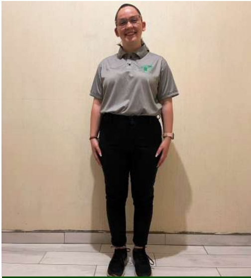
An Example Uniform